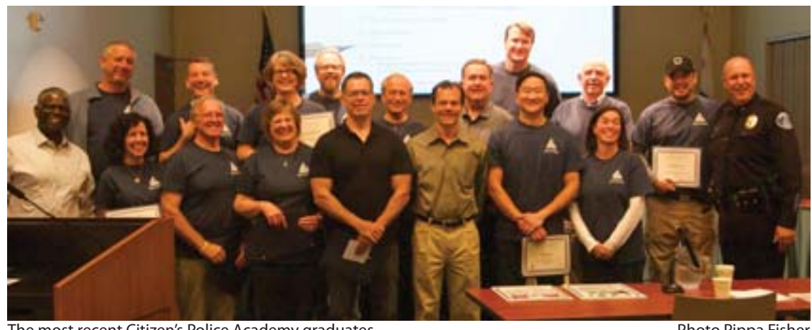
The most recent Citizen's Police Academy graduates.

Lafayette's crime continues to decrease, thanks to a combination of factors, including cameras and the extensive outreach to the public from the police department.