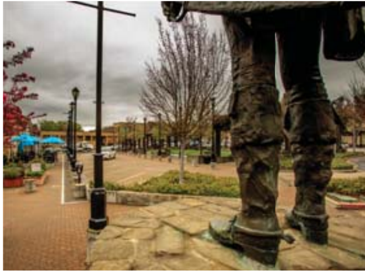
The first place winner was Stu Selland's "Boots on the Square."

The Lafayette Public Art Committee unanimously selected the top three photos submitted in its most recent photo contest, with Stu Selland's "Boots on the Square" winning first place. Fourteen brave Lafayette resi-